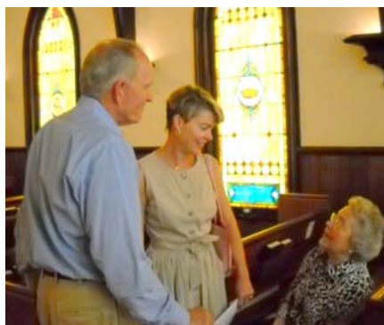
A quick visit before Morning Prayer

Visitors from out of town joined in as we all caught up with one another and community news. Worship, fellowship and food: there's no doubt that at Emmanuel everyone is well fed -- soul and body!